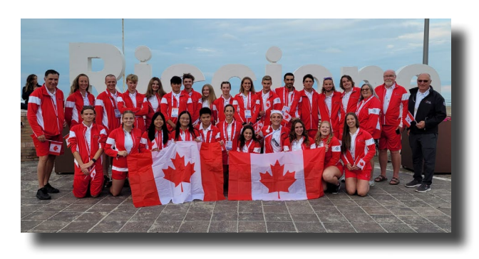
Team Canada at the 2022 Lifesaving World Championships in Riccione, Italy

The next Lifesaving World Championships will be held August 20 – September 8, 2024 on the Gold Coast, Australia.