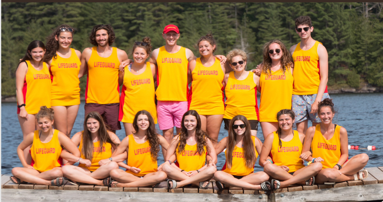
Camp Tamarack staff

Lifeguards across the province took part in the Lifesaving Society's 10 th annual 500 Metre Swim for 500 Lives, held during National Drowning Prevention Week 2018. Thanks to Camp Tamarack and Zodiac Day Camp for participating and fundraising for drowning prevention.