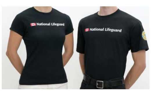
Official National Lifeguard T-shirts are available exclusively from the Lifesaving Society. Visit our Web site and check out The Store for more details.

\mathbf{Y} our NLS card represents the definitive performance requirements and evaluation criteria for Canada's lifeguards based on the Society's research into drowning and water-related injuries, rescue techniques and